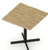
TB CS 80