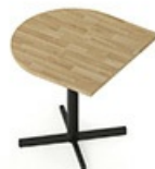
TB CSC 80