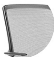
light grey mesh

A breathable membrane only on the backrest of the armchair? Forget it. With the Ovidio you will feel convenience of using it all over the surface. Thanks to this inconspicuous armchair will surprise you from the first use.