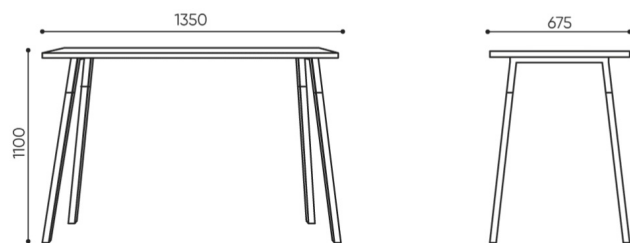
OT W 4L AA H

Wagi dla stolików z blatem z płyty laminowanej. Weights for tables with laminated board top. Gewichte für Tische mit Laminatplatte. Poids pour les tables avec plateau en stratifié.